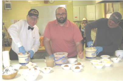
Hundreds of volunteer workers were treated to an ice cream sundae on April 28 and a breakfast buffet on April 29. Thank you, Trinity servants!