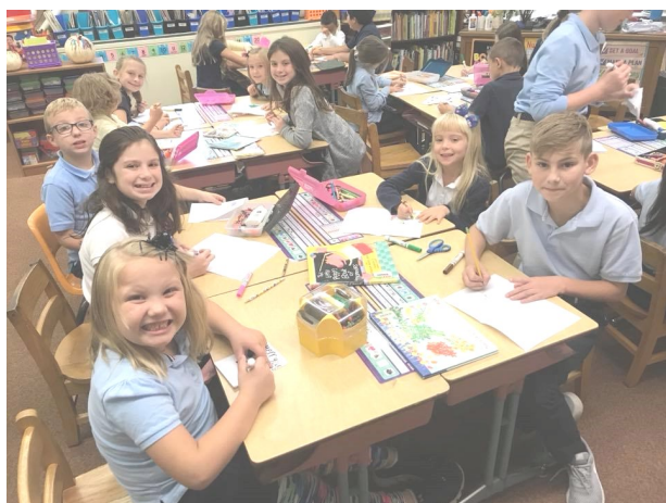
First graders and their fifth-grade 'buddies' work on cards for servicemen overseas.